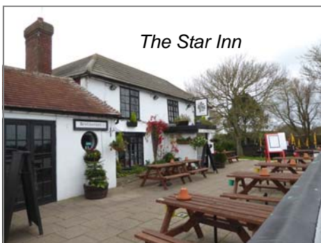
The Star Inn

miscellaneous collection of permanent and holiday homes until I reach the private section belonging to the caravan park. Turning North I walk down the public footpath towards the new automatic level crossing at Normans Bay station and continue along the lane to the Star Inn. Here I read the board explaining the smuggling history of the Inn and river. Still picturesque with its ancient, narrow bridge, I can't resist a photo stop.