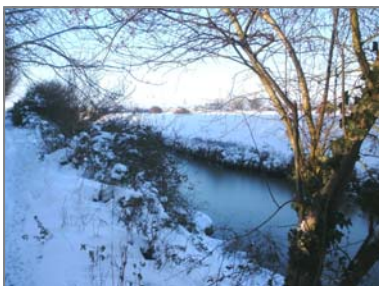
A Winter Scene

Down the village street towards the sea, St James cottages are on the left, named after the chapel which was there before, which in its turn was named after the chapel which stood in Chapel Field a mile north of the Star Inn. Now only fields, Northeye was a medieval village on an eye (island) in the middle of salt flats.