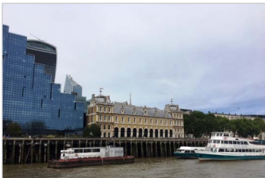
Billingsgate Market from the river