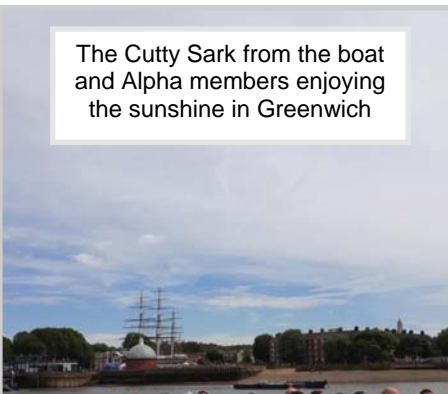
The Cutty Sark from the boat and Alpha members enjoying the sunshine in Greenwich