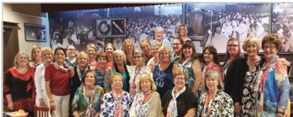
The Golden Gift (Leadership and Management seminar) group reunited

the first time, that Convention will not be the sole responsibility of Pennsylvania State; they will be assisted by the state of Delaware, Maryland, New Jersey and the Federal District of Columbia. (I may have missed some!)