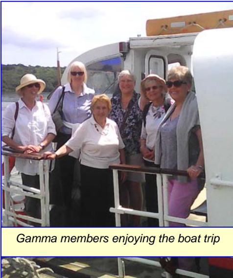
Gamma members enjoying the boat trip

Whilst we were enjoying the very relaxed atmosphere and scene, one of us voiced a desire to take a boat trip. Just at that moment, quite a coincidence, the Captain of the pleasure boat walked by and we were able to ask him how/when we could book a trip. He said he was taking a booked group at 12 noon and if we liked we could be on board as well. He then went on to say that the boat was fully booked but, if we arrived at 11.45am, it would be OK!! Even though, feeling rather guilty, we decided to do so and were settled comfortably when the booked party arrived. We received some rather puzzled looks as they boarded the boat, but all was well as many of them preferred to stand outside at the bow.