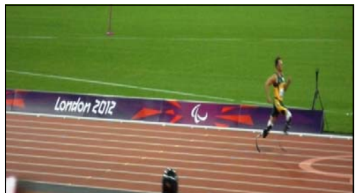
Oscar Pistorius of South Africa on his running legs