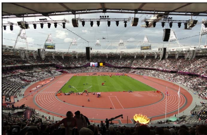
Diana`s view of the Stadium