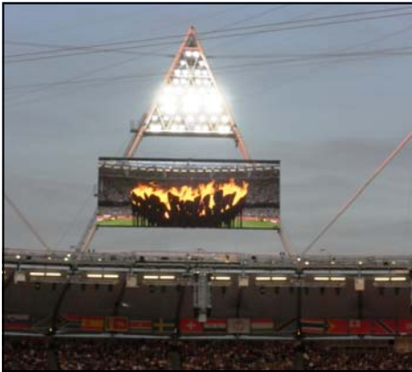
The Stadium at night, with the cauldron shown on the television

I was lucky enough to attend the last day of the Paralympics in the Olympic Park. It was a scorching hot day to explore the Park, seeking shade wherever we could find it. We had tickets for the evening session, and as you can see from the photos, we were only a few rows back from the track, with the finishing line on our right, and the specially designed podium for the award ceremony in front of us.