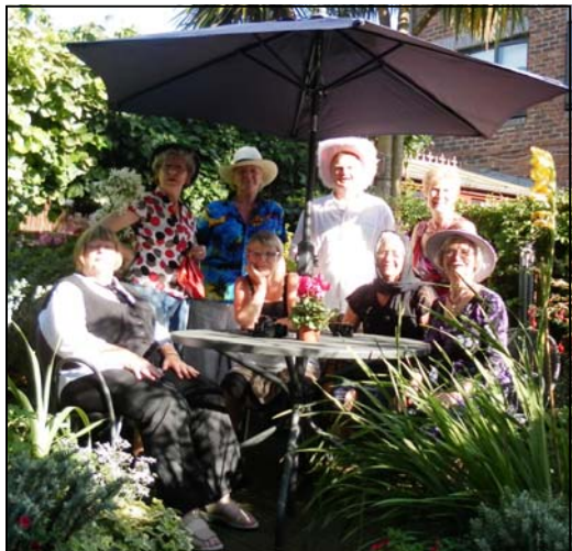
Participants enjoying refreshments in the Garden

had been involved before so it was with some trepidation and plenty of enthusiastic acting that we all participated. Guests had been allocated a character before arriving and invited to come in costume. The photo shows how well they did! The game evolves over the 3 courses of the meal, with clues being presented, suspects being cross-examined and everyone around the table being prepared to adlib –