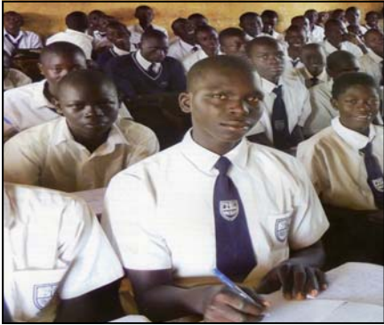
Dr Obote College students